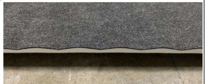
Side view of panel suspended by 20 mm prior to skirt installation