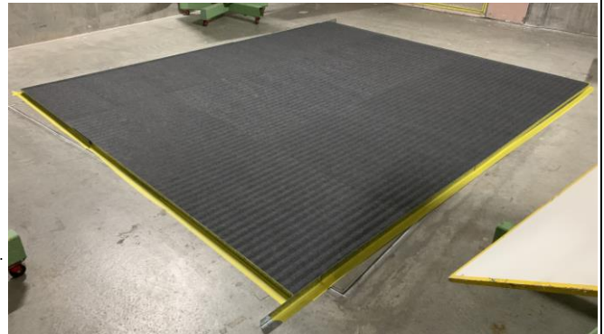
Test specimen installed in laboratory for test